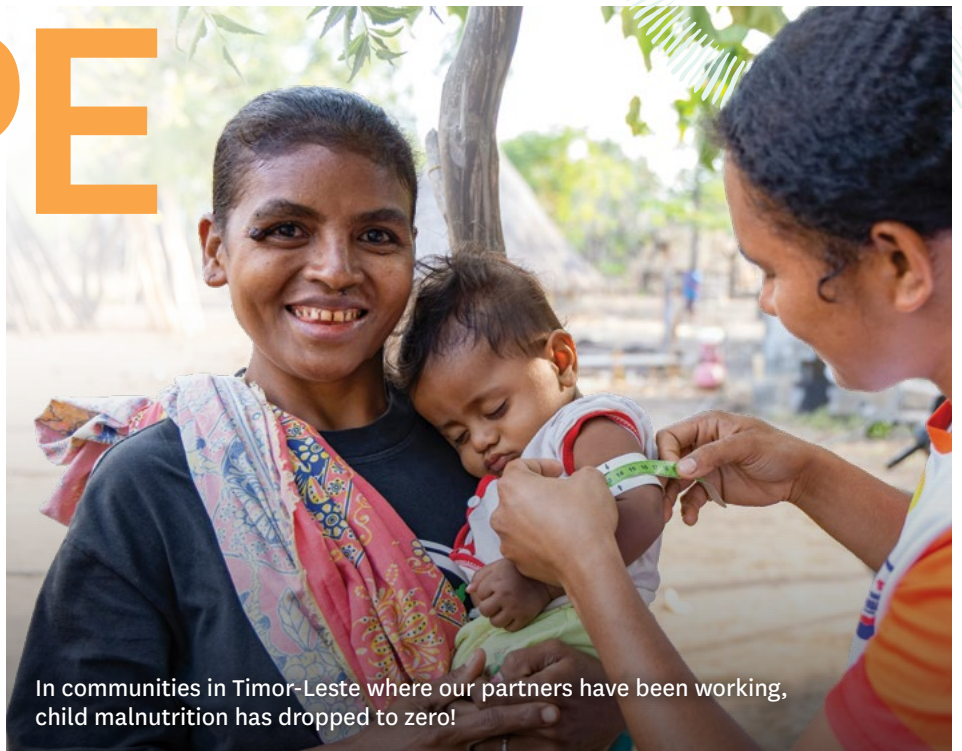
In communities in Timor-Leste where our partners have been working, child malnutrition has dropped to zero!

In Maluku , our church partners hosted multi-faith prayers for the victims of the Bondi massacre at the request of Muslim leaders in Ambon. Strong relationships between faiths are reflected in the