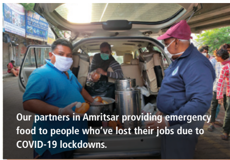
Our partners in Amritsar providing emergency food to people who've lost their jobs due to COVID-19 lockdowns.