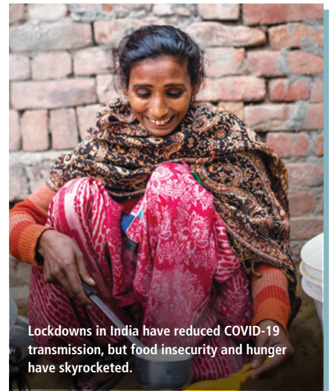
Lockdowns in India have reduced COVID-19 transmission, but food insecurity and hunger have skyrocketed.

"Please join me, in supporting the work of our partner churches through UnitingWorld's COVID-19 Appeal. Now, more than ever, we all need to support one another, so that we can come through this crisis into a world where the basics of life: clean air, water, food, shelter, healthcare, love and community are part of all our lives. Let's join with our global partners in