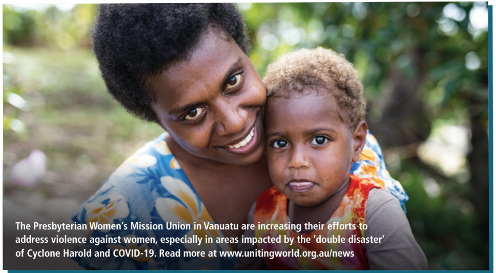
The Presbyterian Women's Mission Union in Vanuatu are increasing their efforts to address violence against women, especially in areas impacted by the 'double disaster' of Cyclone Harold and COVID-19. Read more at www.unitingworld.org.au/news

Casi could live anywhere in the Pacific, including Australia, across Asia or in Africa. Reports of domestic violence across all sections of society have increased during the pandemic.