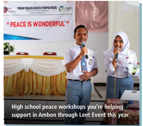
High school peace workshops you're helping support in Ambon through Lent Event this year.

Now it is just up to us – each living human being. Are we going to turn this world to a warzone or to a better place? This is every person's choice. So what's your decision?